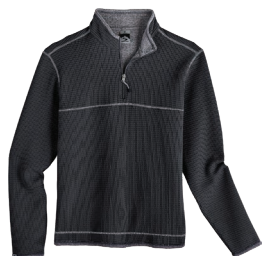
Jet Gray/ Jet Gray