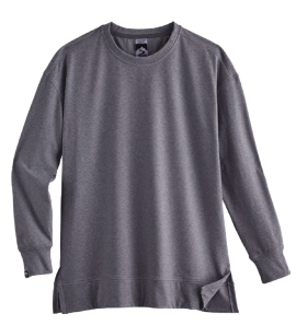
Dark Heather Gray