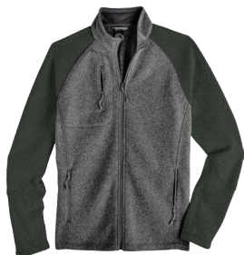
Stone Gray/ Cinder Gray