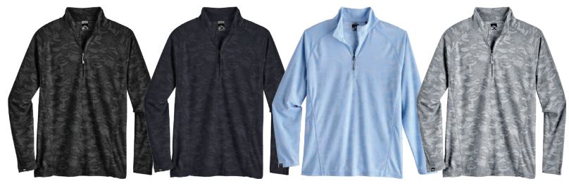
Dark Heather Gray