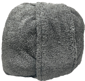
Dark Heather Gray