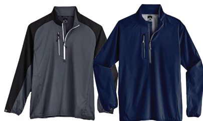
Jet Gray/ Black