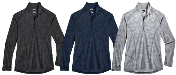
Dark Heather Gray