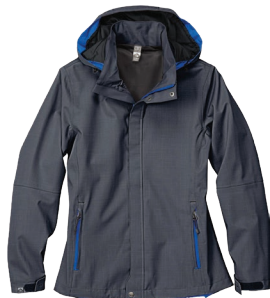
Dark Heather Gray/Cobalt