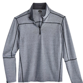
Light Heather Gray