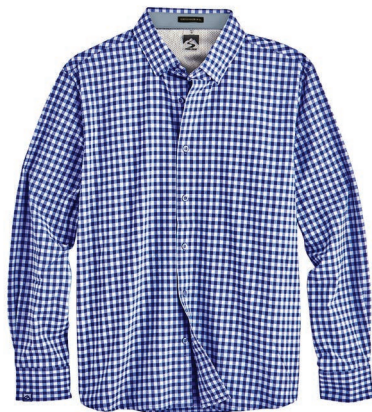
Classic Blue/ Gray