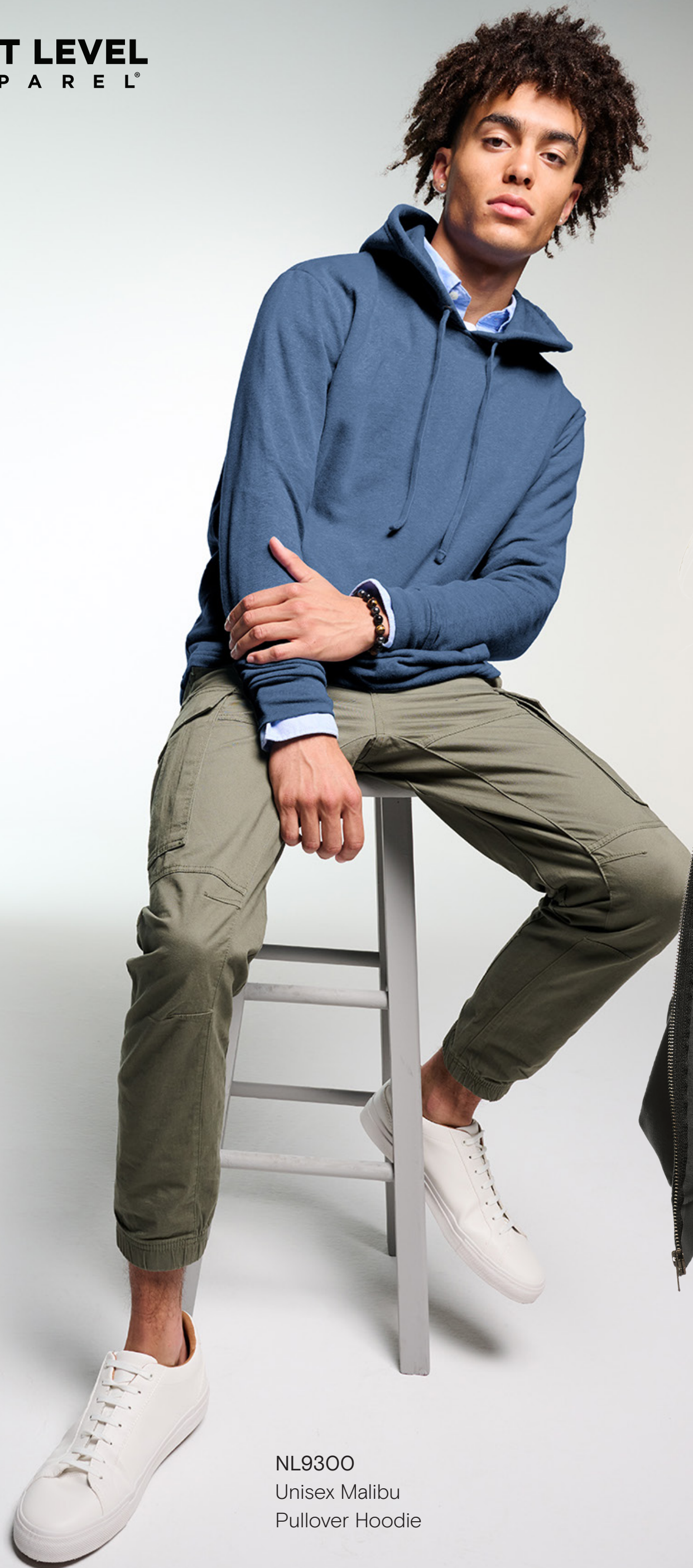
NL9300 Unisex Malibu Pullover Hoodie