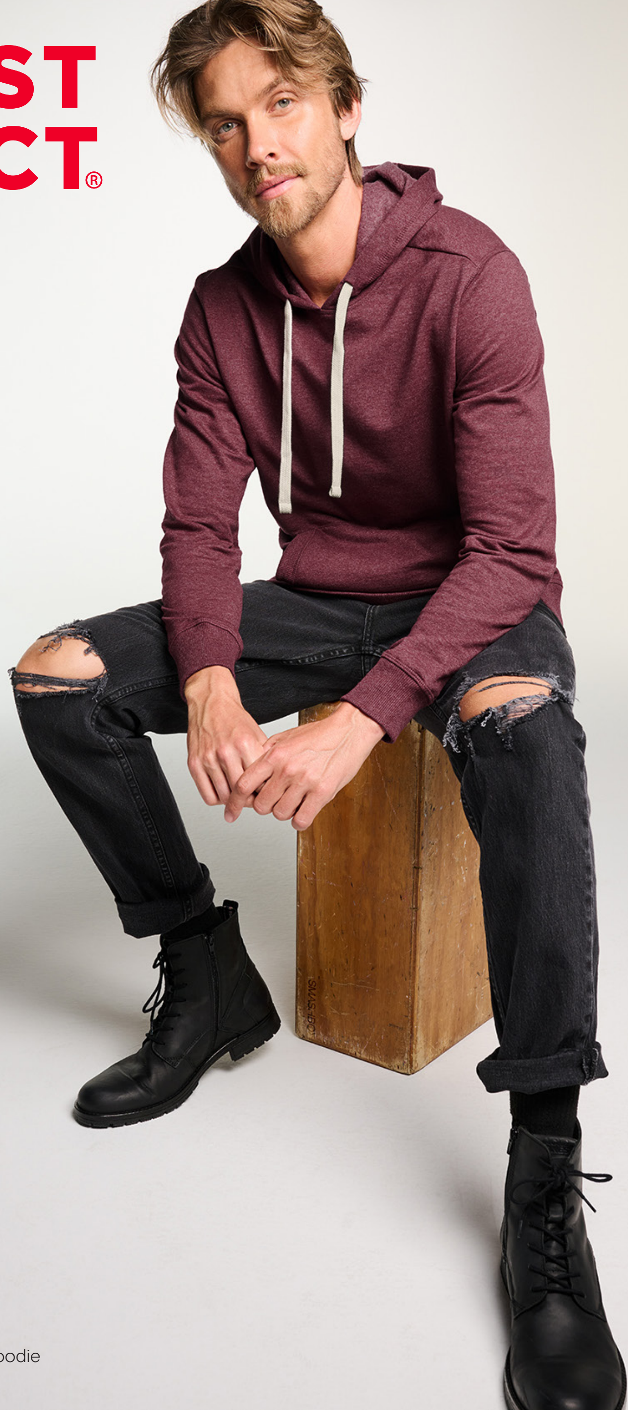
DT8100 Re-Fleece Hoodie