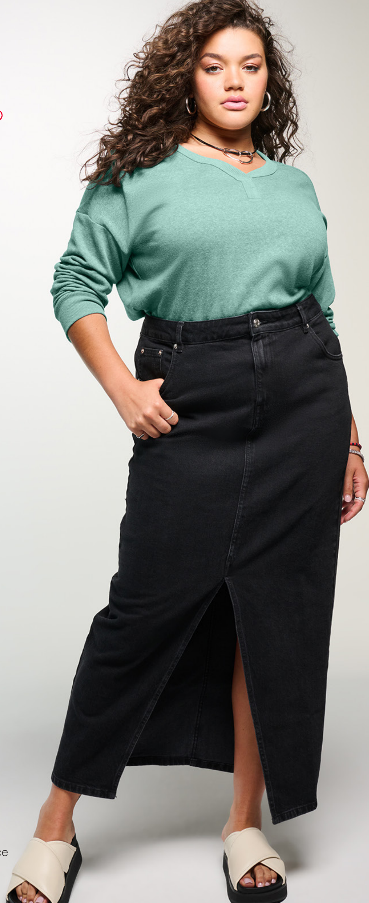
DT1312 Women's Perfect Tri Fleece V-Neck Sweatshirt