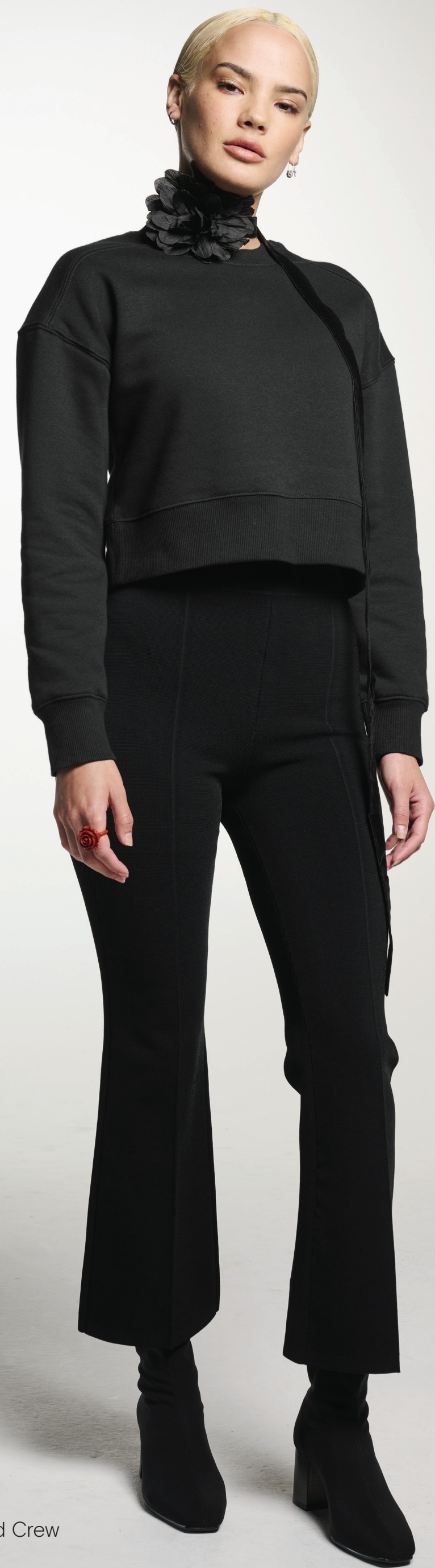
DT1105 Perfect Weight Fleece Cropped Crew