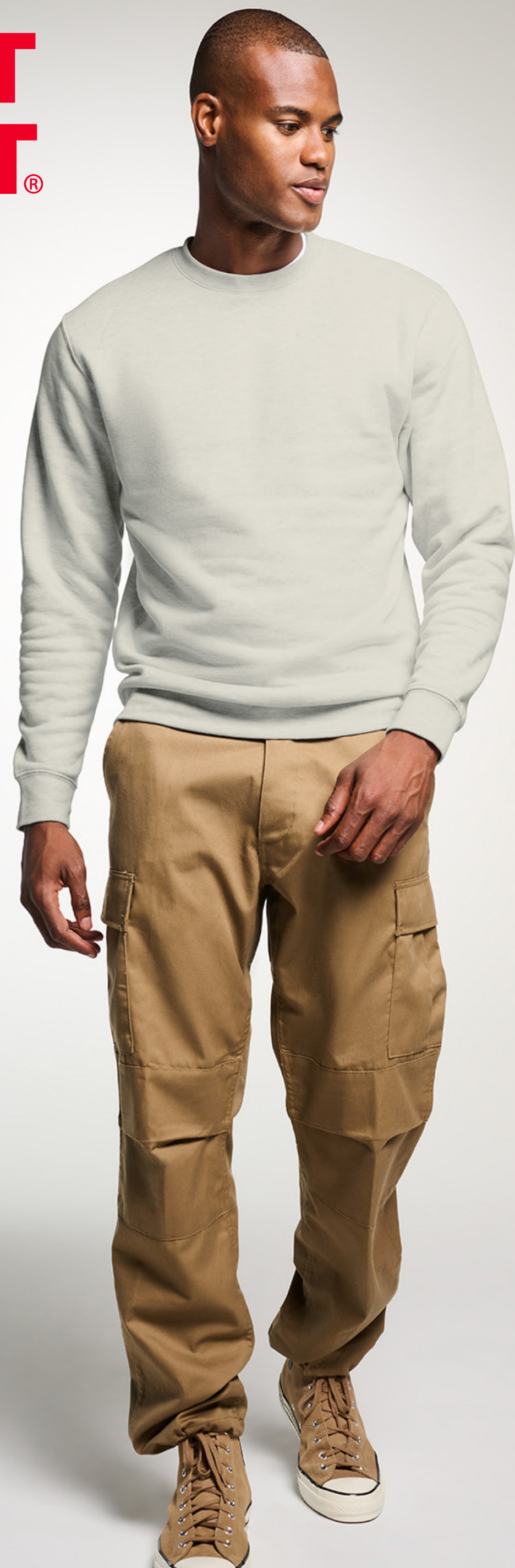
DT6104 V.I.T. Fleece Crew