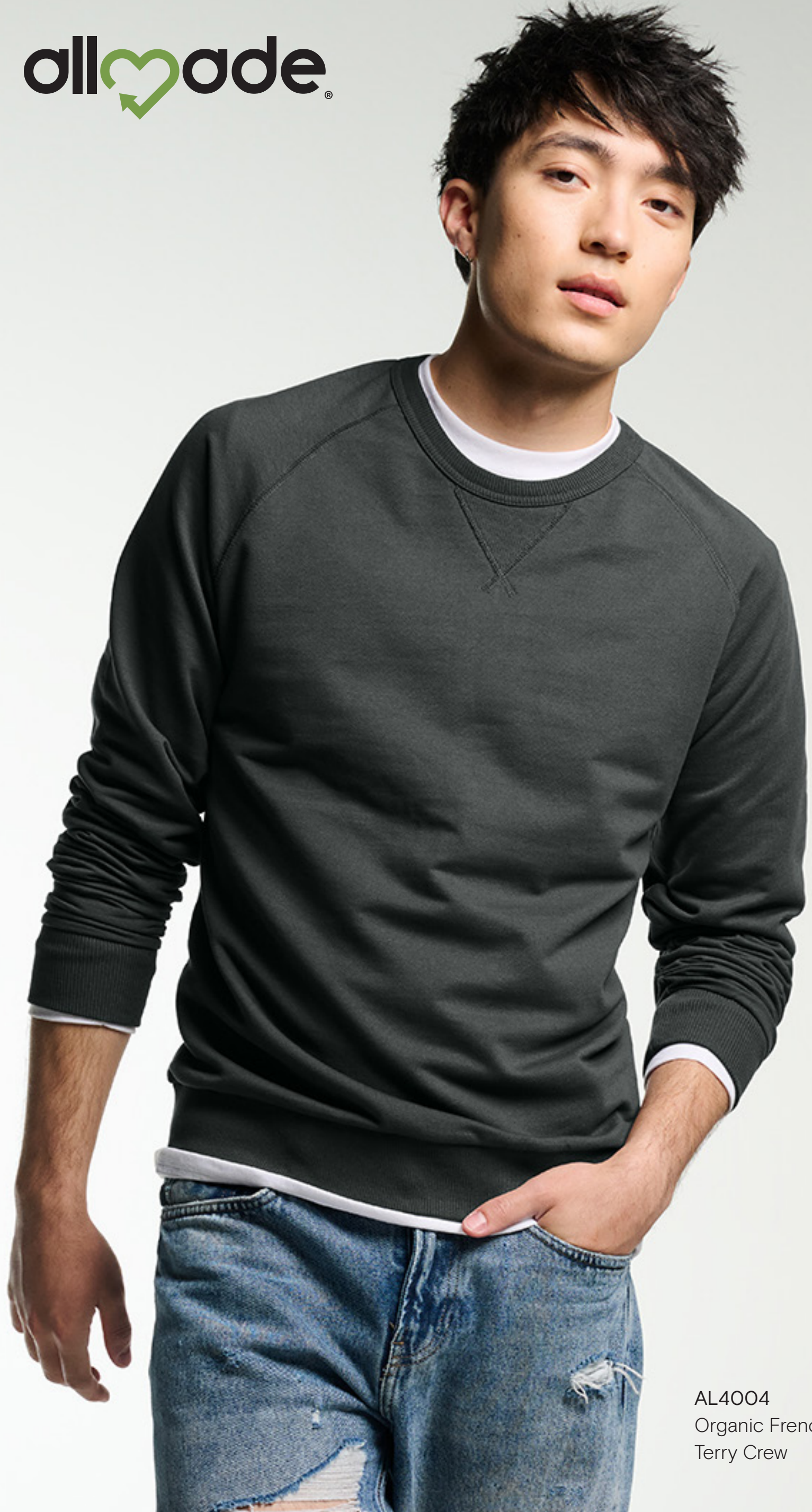
AL4004 Organic French Terry Crew