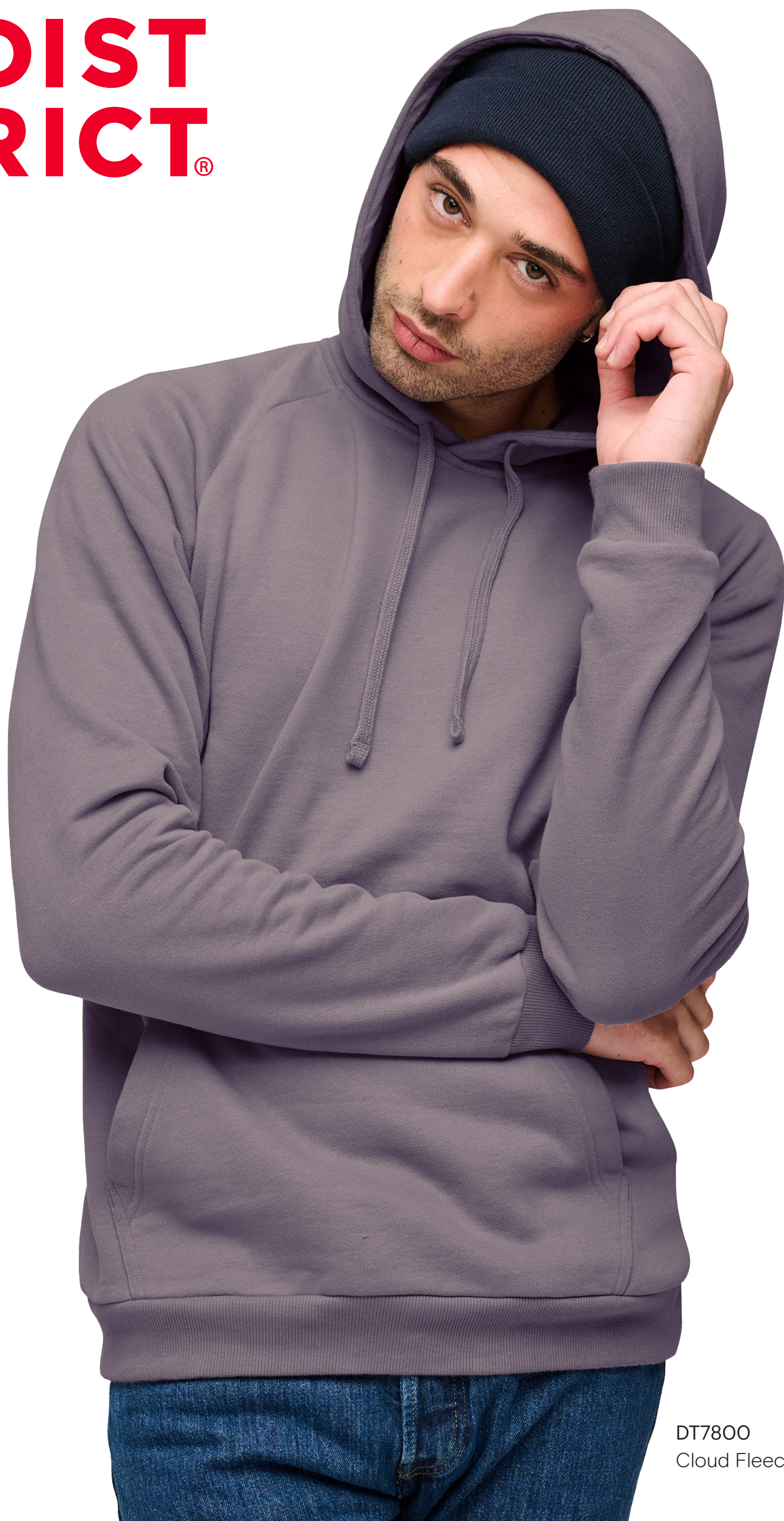
DT7800 Cloud Fleece Hoodie